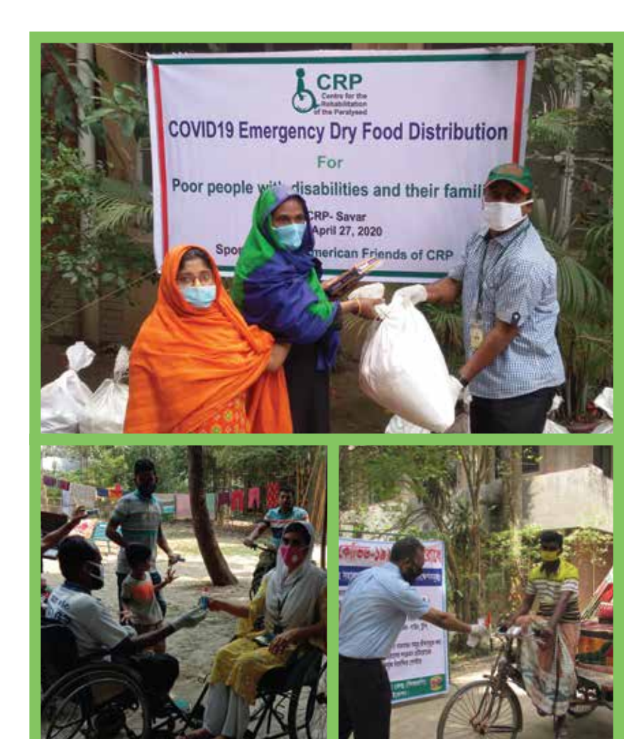
Food, sanitizers and disinfectants distribution

Micro Economic Project of Rehabilitation Wing has followed up to 50 beneficiaries (PWDs) to find out their current well-being and family status over phone. 60 people with spinal cord injury and their family members received counseling services over phone.