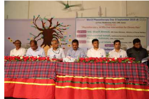
Guests on the stage