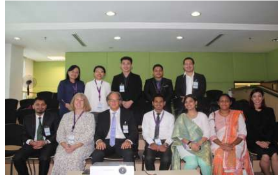
All presenters of the conference