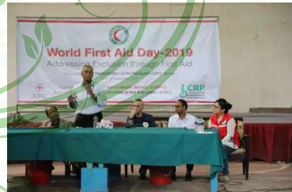
The Executive Director thanking the initiatives of BDRCS and ICRC

CRP organized First Aid training in collaboration with the International Committee of Red Cross (ICRC) and Bangladesh Red Crescent Society (BDRCS) on 16th September 2019. The training was organized to celebrate the World First Aid Day which was on 14th September. The theme of the day was, 'Addressing Exclusion through First Aid'. ICRC sponsored the training and BDRCS facilitated the training. A total of 35 participants attended the training which includes staff with disabilities, students of health professions and patients of CRP. The training aimed to train persons with disabilities and students on basic first aid techniques as well as to gain orientation on how to train persons with disabilities. The contents of the training were burn, fracture, choking, wound, CPR, and so on. The participants received a certificate of attendance issued by ICRC. On the day of the training, Deputy Secretary General of BDRCS, ICRC First Aid Delegate, Country Representative of German Red Cross and Executive Director of CRP were present in the inauguration session. The participants were very happy with the contents, methods and all the arrangements of the training. The significant impact of the training is the changes in the attitudes of BDRCS trainers and volunteers.