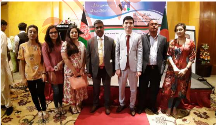
BHI Principal, MRS Faculty & Foreign students at the celebration of 100th anniversary of independence of Afghanistan