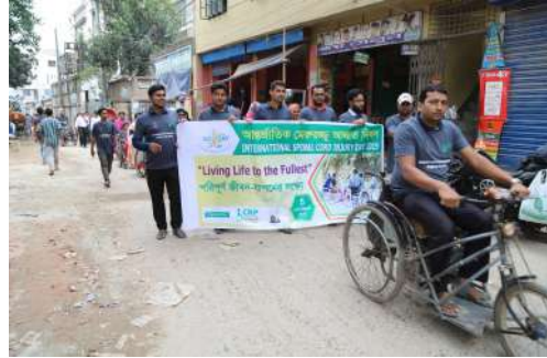
CRP celebrates SCI Day with rally, human chain and sports competition