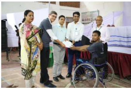
Guests handing over the prizes to the participants of the sports competition