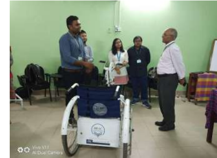
A team from Brac University presenting CRP's Executive Director talking to the team