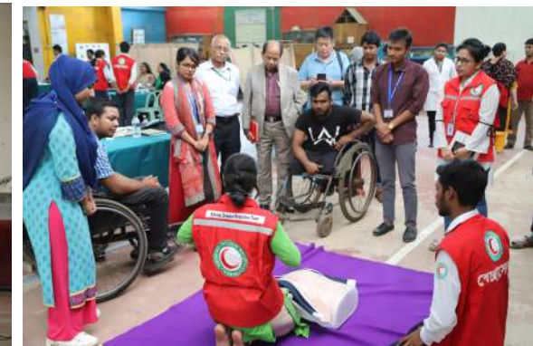
Persons with disabilities and students receiving First Aid training