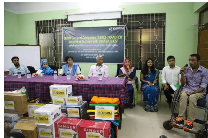
A trainee sharing his experience

For Donation, Zakat & Membership Please contact: