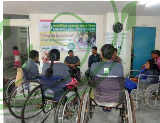
Group discussion on the occasion of SCI Day at CRP-Pabna