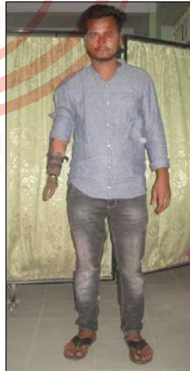
LN4 below elbow