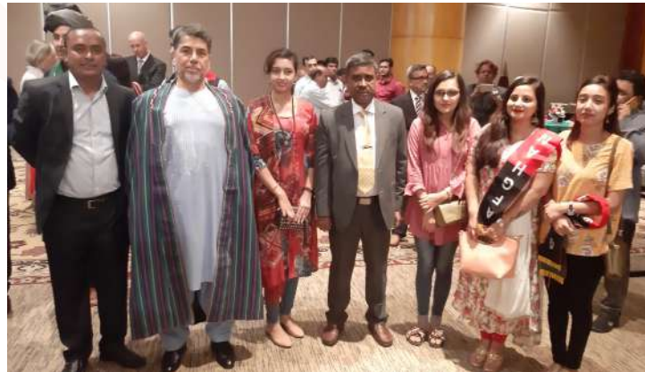
BHI Principal, MRS Faculty & Foreign students with His Excellency the Ambassador of Afghanistan

The Principal, faculty & foreign students of M.Sc. in Rehabilitation Science program of BHPI (An academic institute of CRP) participated and meet with His Excellency the Ambassador of Afghanistan in the Celebration of 100th Anniversary of Afghanistan's Reclamation of Independence on 08 September 2019 from 7pm-9 pm at The Westin Dhaka. The students from SAARC Member States have been studying with scholarships under the project of "Regional Inter-professional Master's Program in Rehabilitation Science" funded by SAARC Development Fund (SDF).