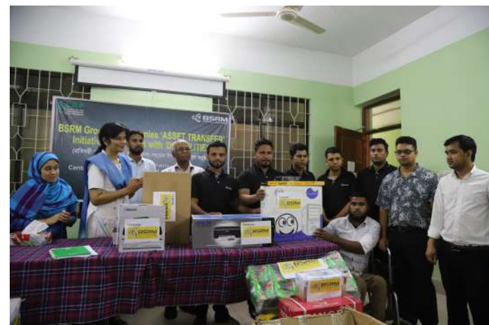
A trainee receiving computer and other accessories