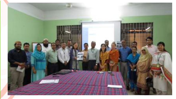
CRP's staff launched OPAS

CRP launched its online payment appointment system (OPAS) on 1st November, 2018. Now the patients can book appointments with the doctors and therapists at CRP from their home. OPAS will also help to reduce the patient queue and the patients will receive services more timely. This facility is only available at CRP-Savar now but soon CRP-Mirpur will offer this service to its patients. It will save patients time and ensure smooth delivery of all services.