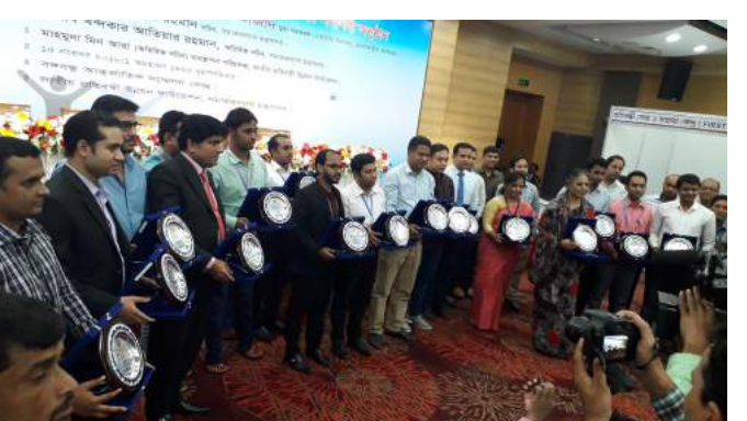
All participating organization holding the memento