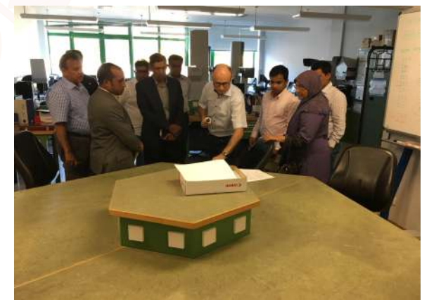
Visit during seminar