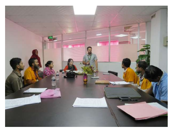
The research team is conducting a Focus Group Discussion