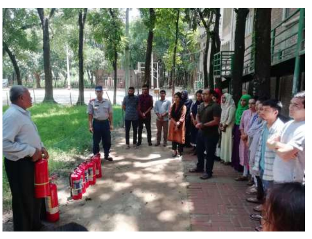
Fire fighting trial

A "Fire Safety and Fire Fighting Trial" was held on August 19, 2019 at the premise of International Hostel, BHPI, CRP, Savar under the project of "Regional Inter-professional Master's Program in Rehabilitation Science" funded by SAARC Development Fund (SDF). The 5th batch foreign students of M.Sc. in Rehabilitation Sciences and local students of Bachelor programs of BHPI participated in the event.