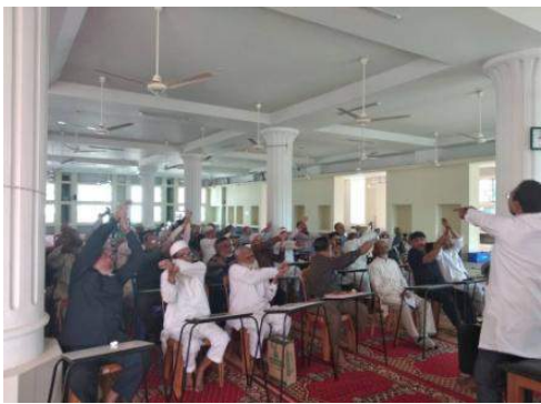
Demonstrating exercises by a therapist