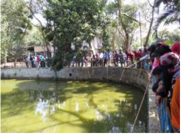
People enjoying fishing