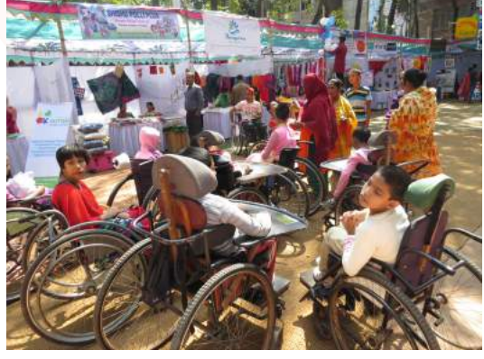
Children with disabilities enjoying the fair