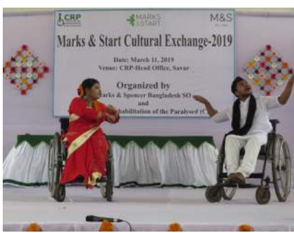
Persons with disabilities performing during the occassion